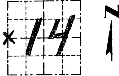
LOCATION (Indicated by "X")

CORNER NO. 58 SECTION 14 TOWN 5 N RANGE 2 W W 1/4 COR.