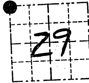
LOCATION (Indicated by "●")

CORNER NO. 91 SECTION 29 TOWN 5 N RANGE 1 W