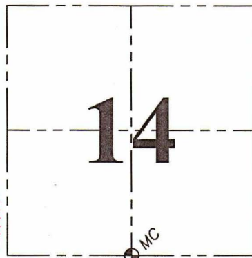
⊕ = CORNER LOCATION