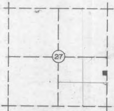
Location Map Hazel Green Twp.