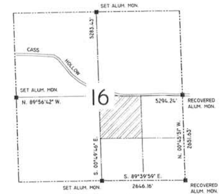
SECTION 16, T. 6 N., R. 1 W. SECTION SUMMARY (NOT TO SCALE)