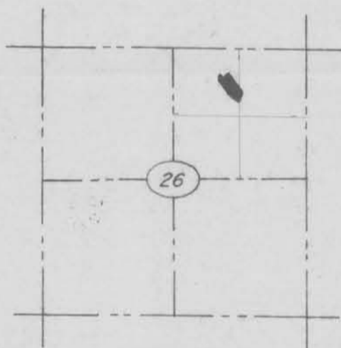
Location Map Wyalusing Township T6N, R6W of the 4th P.M.