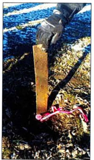
"STEEL STAKE" RECOVERED AS I BELIEVED REFERENCED IN V1028/P476 AT POINT "A"

SAID PARCEL CONTAINS 2.00 ACRES, MORE OR LESS.