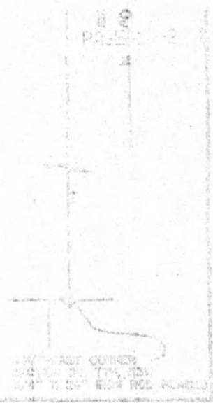
SOUTHEAST CORNER SECTION 35, T7N, R3W 3/4" X 24" IRON ROD PLACED